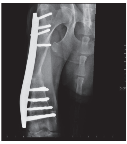
Figure 3: Sixteen week postoperative craniocaudal radiograph of the right femur demonstrating bone union.

proximal right humerus using a separate set of surgical equipment. The graft was gently packed into the fracture site underneath the omentum. The wound was closed routinely and immediate postoperative radiographs were obtained. The analgesic regime was identical to that used after the first stage of the procedure. The dog was discharged five days postoperatively and the owner was asked to limit exercise to short controlled lead walks and to perform passive range of motion exercises of the stifle and hip joints four times daily. Enrofloxacin 5 mg/kg and meloxicam 0.1 mg/kg were continued once daily per os for a total of 30 days. The patient was re-examined at four weekly intervals for 16 weeks. On clinical examination four weeks postoperatively, the dog was consistently using the right pelvic limb and demonstrated a moderate weight bearing lameness. The muscle atrophy noted preoperatively remained. Orthogonal radiographs of the right femur revealed minimal bone reactivity when compared to the postoperative studies. At eight weeks, the lameness had improved and there was increased right thigh muscle mass but minimal radiographic changes remained. At 16 weeks, the dog demonstrated only a mild residual lameness and there was clinical and radiographic evidence of bone union (Figure 3). At one year, the owner reported the dog had returned to normal work without lameness.