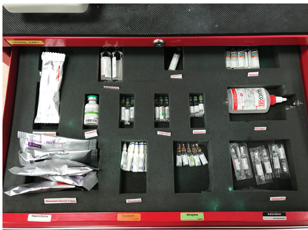
Fig 2: It can be useful to have an area set aside for emergency equipment to be readied, with a box of the most common emergency medicines

The aim of the cardiovascular assessment is to identify signs of hypoperfusion and hypoxaemia. Shock in its simplest terms is an imbalance in oxygen delivery ( DO_2 ) compared to oxygen use ( VO_2 ) by the tissues (that is, DO_2 < VO_2 ). The resultant tissue hypoxia can have both local and global effects as it can rapidly lead to ischaemia and causes cellular dysfunction and death (Rochar and others 1994); if significant numbers of cells throughout the body, or moderate numbers in key organs, are thus affected, a vicious circle of worsening