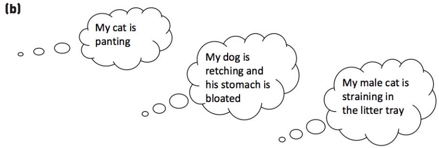
Fig 1: (a) It is important that the whole practice team is trained in telephone triage and can identify those emergencies that require an immediate appointment, and they should be aware of certain phrases (b) which give cause for real concern

The primary survey looks at four aspects centred on the major body systems (MBSs) – cardiovascular, respiratory and neurological – and can be performed rapidly. The mnemonic ABCD makes the key points of the primary survey easy to recall (Box 1). An abnormality in any of these areas is an indication that immediate action is required and cardiopulmonary arrest may be imminent. The animal should be quickly transferred to the clinical treatment area, preferably away from the owner, and resuscitative measures started. The owner should be asked to wait in a private area (such as an empty consultation room) and verbal consent for treatment and a capsule history obtained.