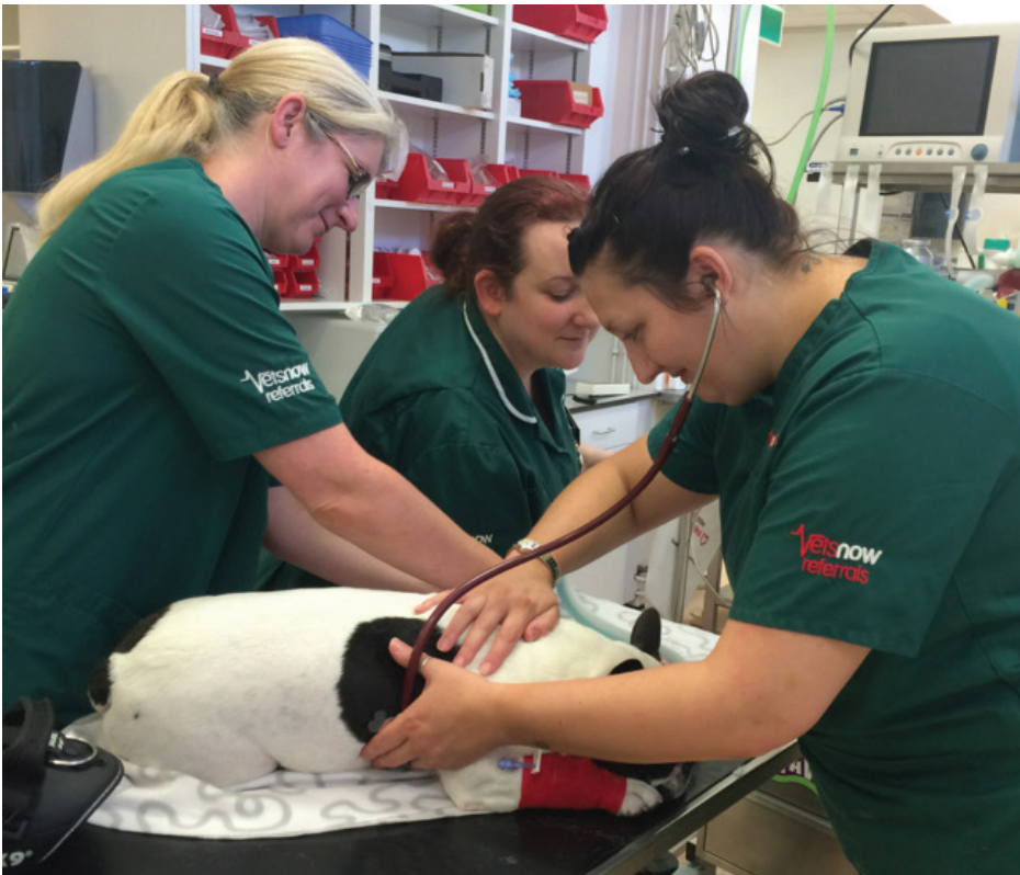
Fig 3: Animals that appear stable when the initial telephone call was made could have deteriorated on the way to the practice, so all patients should be triaged on arrival

heart rate and contractility increase. This results in tachycardia, as well as taller and narrower pulses (which are often described as hyperdynamic). At this compensatory stage of shock, cardiac output is increased and this can be seen from the greater pulse volume [Fig 4]. The change in pulse quality resulting from further volume depletion can also be seen clearly and is reflected clinically by the progression to thin, increasingly weak ('thready') pulses as the compensatory response becomes exhausted.